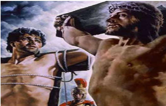
There are two kinds of Christians today in the Church. One kind is like the first thief...

But James poses a question to the ones who have such a common idea. In fact he thunders, "What is your life?" James is very direct. He slaps you in your face and makes you think. James' question is a very important one. "What is your life?" Have you thought about this question? Have you thought of answering this question? Have you thought what your life is? James is not asking "What is life?" rather he is asking "What is your life?" Many of us carry on living even if we don't know why. We need not be philosophers to answer James' question. We know what our life is. We know what we life for.